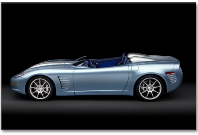
Callaway C16 Speedster 700 hp $305,000

Please see callawaycars.com for complete C16 details